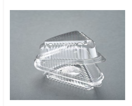
Pie Wedge Container