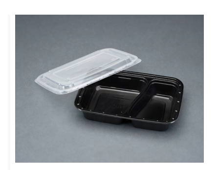
Two Section Container