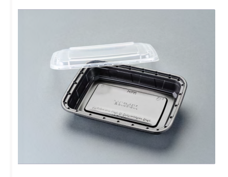
28oz Food Container