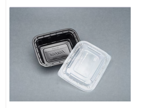
14oz Food Container