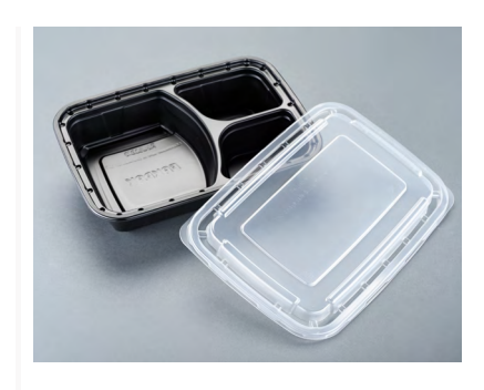
3 Section Food Container