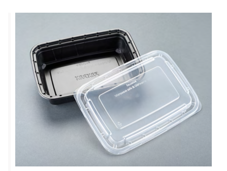
34oz Food Container