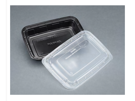
18oz Food Container