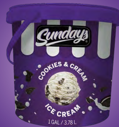
Cookies & Cream Ice Cream 1 Gallon (3.78L)