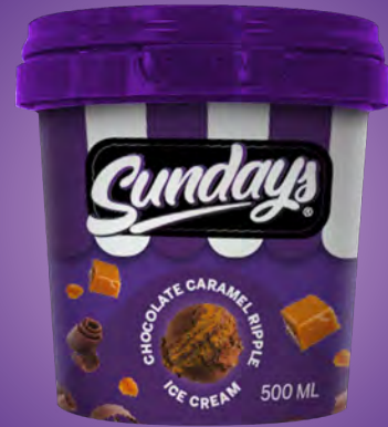
Chocolate Caramel Ripple Ice Cream 0.5 Litre