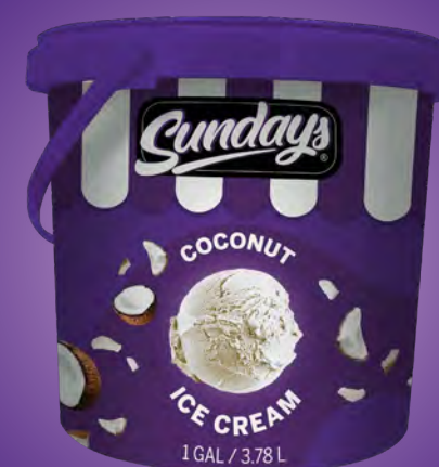
Coconut Ice Cream 1 Gallon (3.78L)