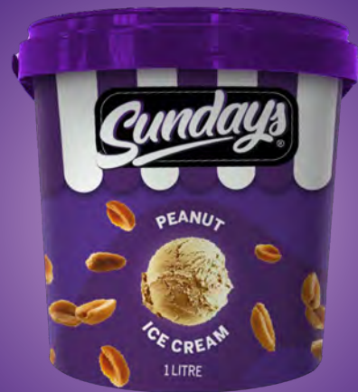
Ice Cream 1 Litre