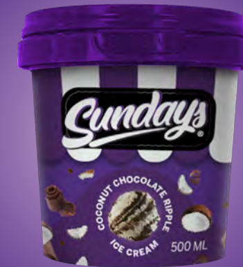
Coconut Chocolate Ripple Ice Cream 0.5 Litre