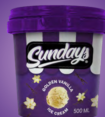
Golden Vanilla Ice Cream 0.5 Litre