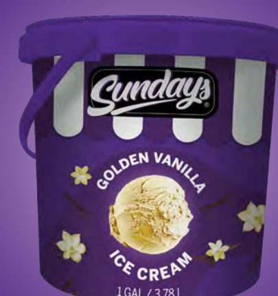
Golden Vanilla Ice Cream 1 Gallon (3.78L)