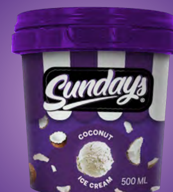
Coconut Ice Cream 0.5 Litre