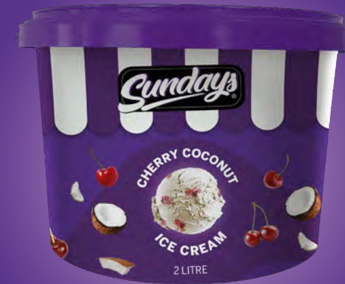
Cherry Coconut Ice Cream 2 Litre