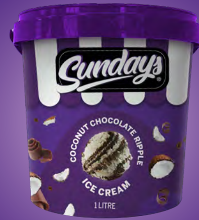
Coconut Chocolate Ripple Ice Cream 1 Litre