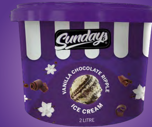
Vanilla Chocolate Ripple Ice Cream 2 Litre