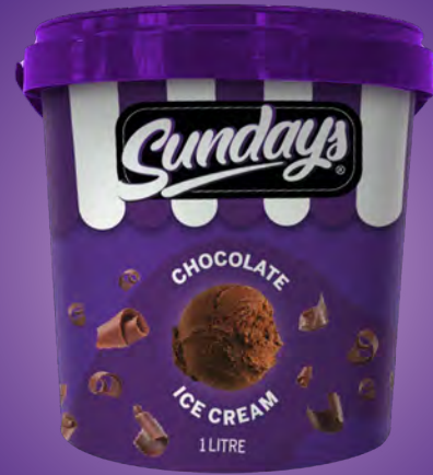
Chocolate Ice Cream 1 Litre