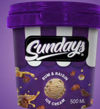
Rum & Raisin Ice Cream 0.5 Litre