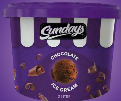
Chocolate Ice Cream 2 Litre