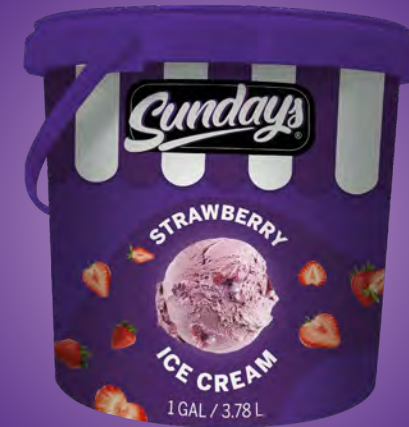
Strawberry Ice Cream 1 Gallon (3.78L)