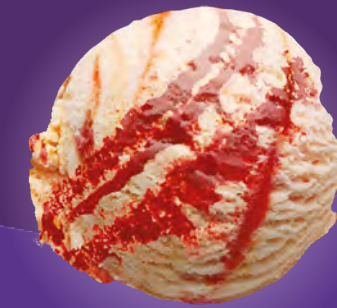
Strawberry Cheesecake Ripple