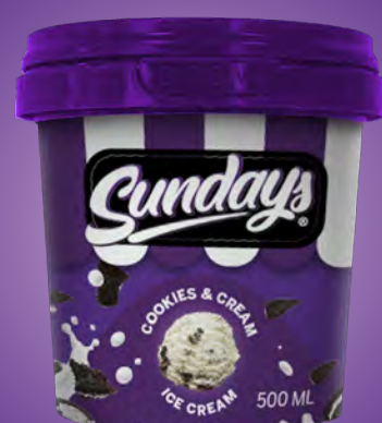
Cookies & Cream Ice Cream 0.5 Litre