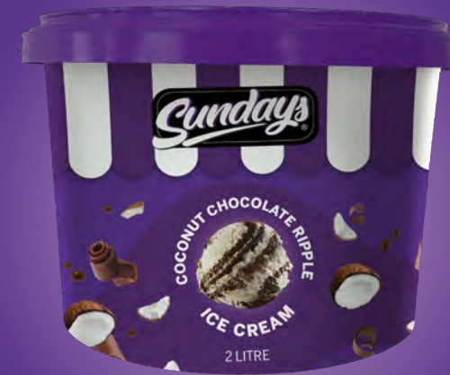
Coconut Chocolate Ripple Ice Cream 2 Litre