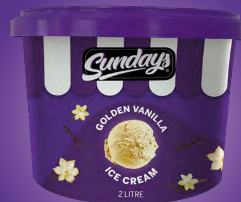
Golden Vanilla Ice Cream 2 Litre