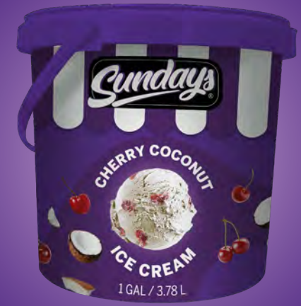
Cherry Coconut Ice Cream 1 Gallon (3.78L)