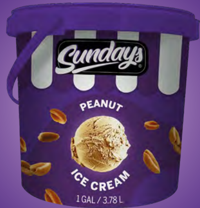
Peanut Ice Cream 1 Gallon (3.78L)