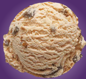
Rum & Raisin