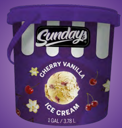
Cherry Vanilla Ice Cream 1 Gallon (3.78L)