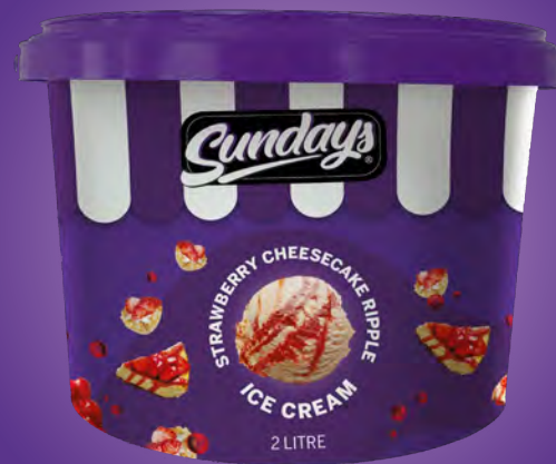
Strawberry Cheesecake Ripple Ice Cream 2 Litre