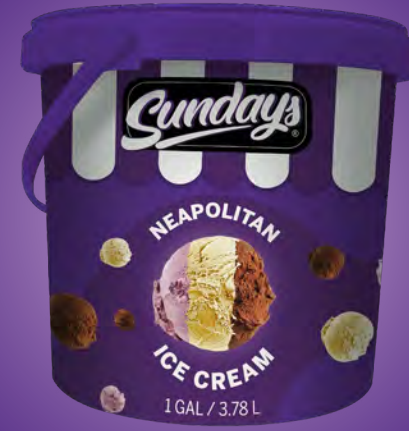
Neapolitan Ice Cream 1 Gallon (3.78L)