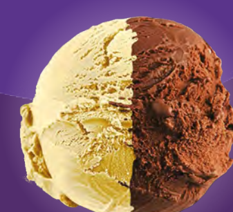
Golden Vanilla Chocolate