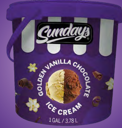
Golden Vanilla Chocolate Ice Cream 1 Gallon (3.78L)