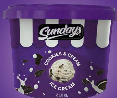
Cookies & Cream Ice Cream 2 Litre