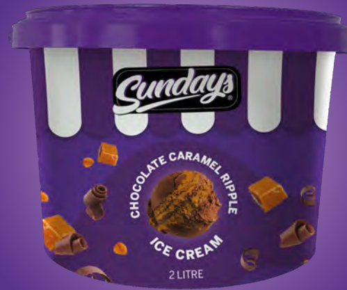
Chocolate Caramel Ripple Ice Cream 2 Litre