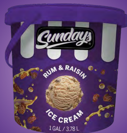
Rum & Raisin Ice Cream 1 Gallon (3.78L)