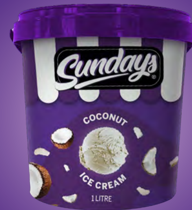
Coconut Ice Cream 1 Litre