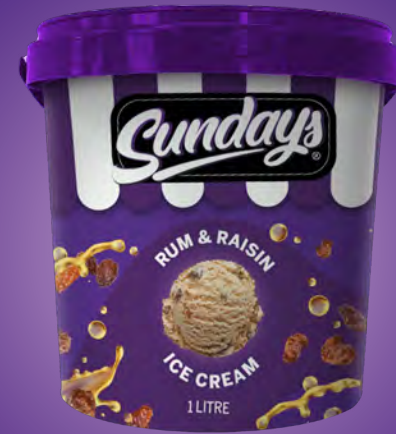
Rum & Raisin Ice Cream 1 Litre