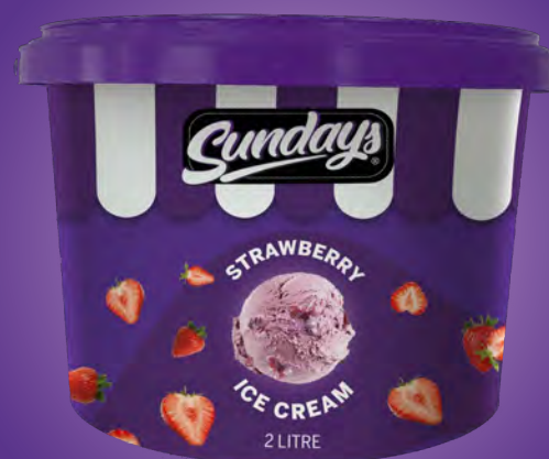
Strawberry Ice Cream 2 Litre