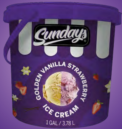
Golden Vanilla Strawberry Ice Cream 1 Gallon (3.78L)