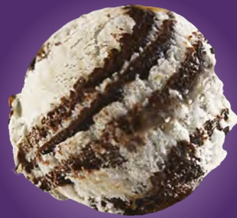
Coconut Chocolate Ripple