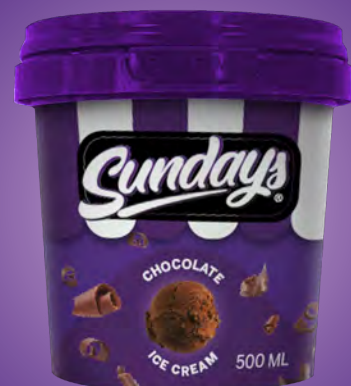
Chocolate Ice Cream 0.5 Litre