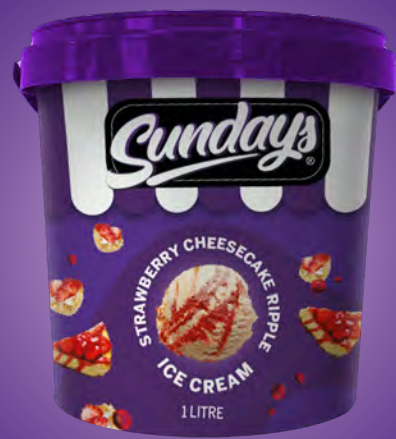
Strawberry Cheesecake Ripple Ice Cream 1 Litre