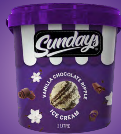
Vanilla Chocolate Ripple Ice Cream 1 Litre