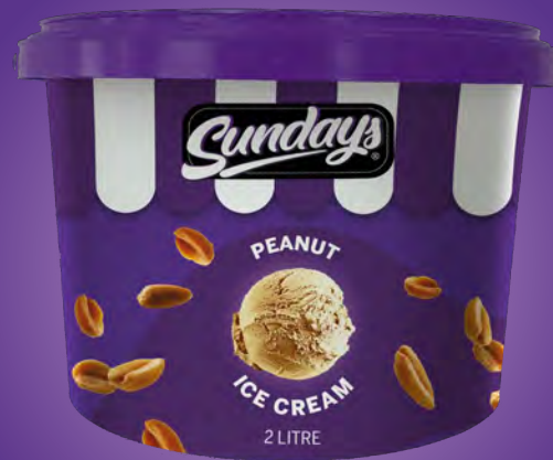
Peanut Ice Cream 2 Litre