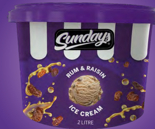
Rum & Raisin Ice Cream 2 Litre