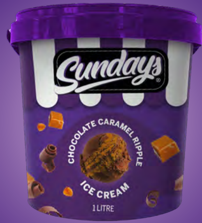
Chocolate Caramel Ripple Ice Cream 1 Litre