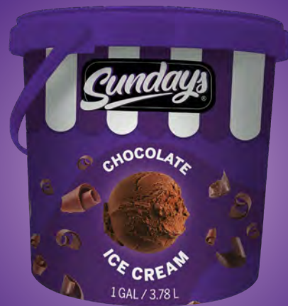
Chocolate Ice Cream 1 Gallon (3.78L)