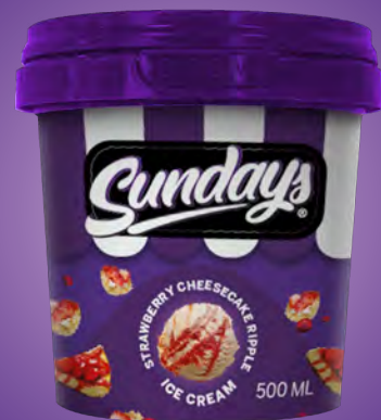
Strawberry Cheesecake Ripple Ice Cream 0.5 Litre