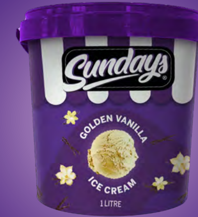
Golden Vanilla Ice Cream 1 Litre