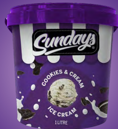
Cookies & Cream Ice Cream 1 Litre