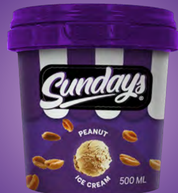
Peanut Ice Cream 0.5 Litre