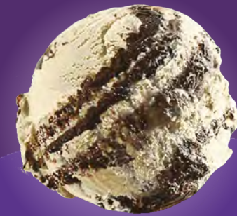
Vanilla Chocolate Ripple