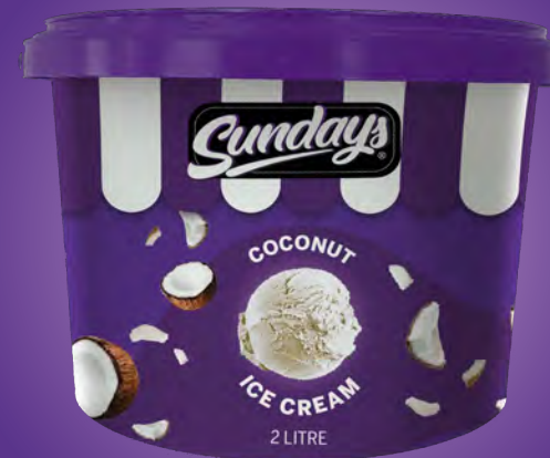
Coconut Ice Cream 2 Litre