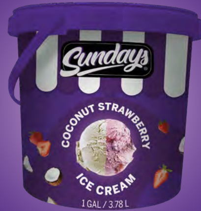
Coconut Strawberry Ice Cream 1 Gallon (3.78L)