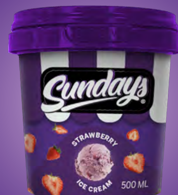
Strawberry Ice Cream 0.5 Litre