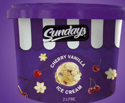
Cherry Vanilla Ice Cream 2 Litre