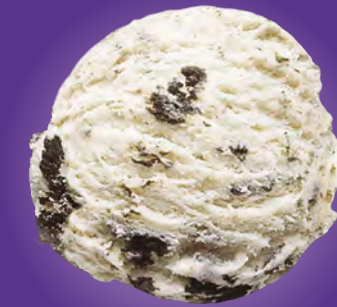
Cookies & Cream