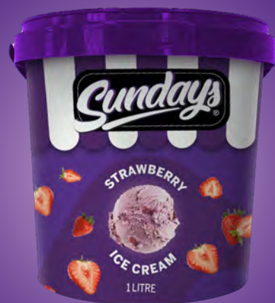
Strawberry Ice Cream 1 Litre