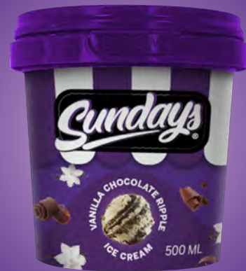
Vanilla Chocolate Ripple Ice Cream 0.5 Litre