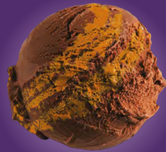
Chocolate Caramel Ripple