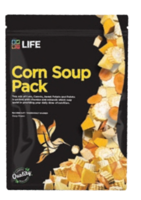
Corn Soup Pack