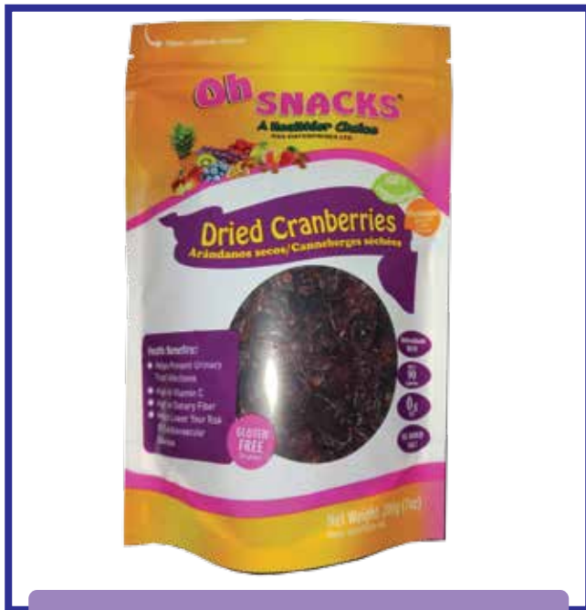
Product Name: Cranberry Reference ID: DFCB2271 Net. Wt.: 200g