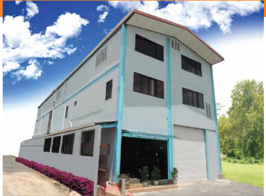
Our manufacturing facility of 15,000 ft 2 , including refrigerated warehousing

“Oh Snacks” currently operates out of a combined 15,000 sq feet manufacturing, storage and office administration space in Trinidad. This facility includes separate buildings for processing different types of products at different stages in the manufacturing process as well as different refrigerated warehouses for storing both raw materials and finished goods.