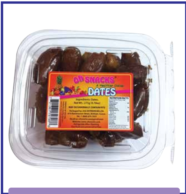
Product Name: Dates Reference ID: DFD275 Net. Wt.: 275g